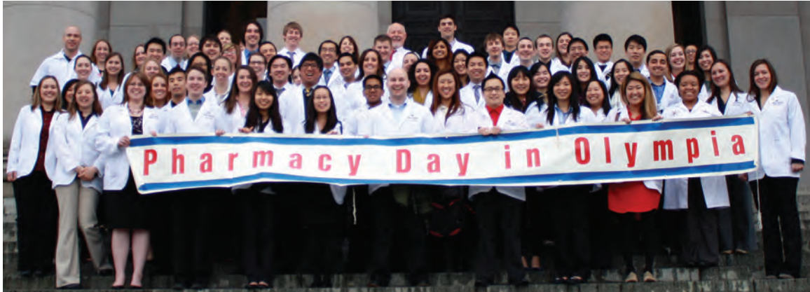
Pharmacy students and faculty members from the UW and WSU are joined by pharmacy practitioners and alumni in Olympia at this annual event sponsored by the Washington State Pharmacy Association.