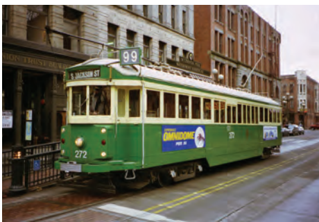
Benson Trolley, circa 1994

The Puget Sound Business Journal recently reported that the Seattle Department of Transportation is considering bringing the Benson Waterfront Trolley back to downtown Seattle.