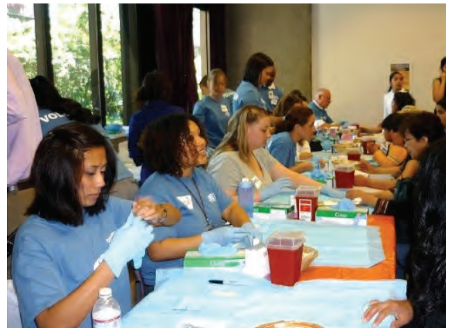
LEFT: PharmD students counsel a Hearthstone resident at an osteoporosis screening organized by ASCP. RIGHT: UW health sciences students provide screenings to attendees at a recent Latina Health Fair.

staff. In addition, some students have conducted or participated in research at Hearthstone. Others have assisted residents in the yearly “Wellness Walk” around Green Lake.