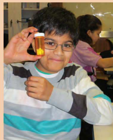
PHOTOS AT LEFT: PharmD students teach elementary school students and their chaperones how to compound lactose capsules. (The field trip students were, of course, instructed to dispose of the pills properly afterward.) ABOVE: A student shows off the finished product.