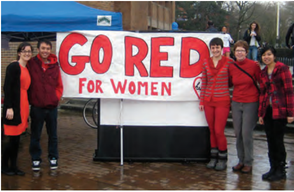
A group of UW health sciences students and their nursing preceptor at a February outreach event on the UW campus.

Three out of four Americans with chronic health conditions such as diabetes and heart disease don't take their medications as directed. This can lead to serious complications or to hospital admissions.