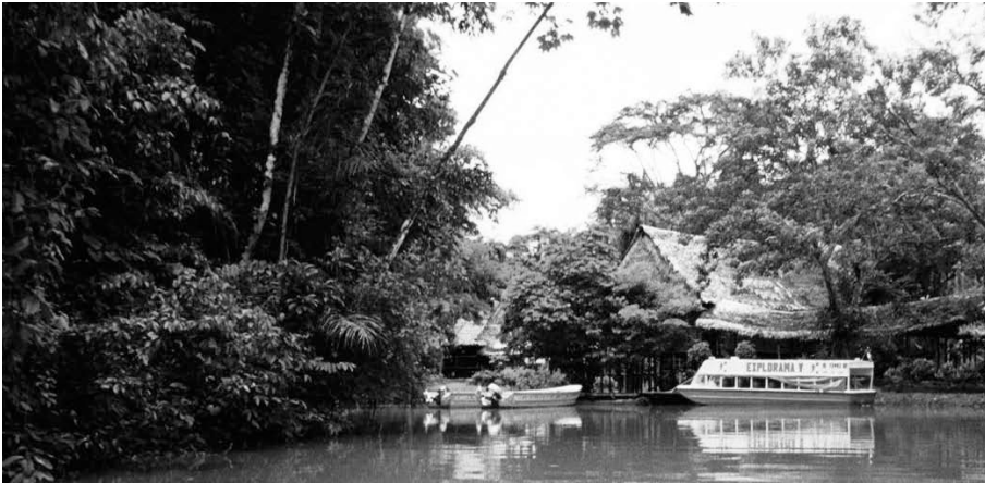
The Explorama Jungle Lodge offers a unique learning environment within the heart of the Amazon.

UW Continuing Pharmacy Education is jointly sponsoring, with the UW School of Medicine Office of Continuing Education and UW School of Nursing Office of Continuing Education, the Amazon Healthcare Expedition: Pharmacy from the Rainforest, Global Perspectives in Health Care Conference, March 1-9, 2008, at the Explorama Lodge in Peru.