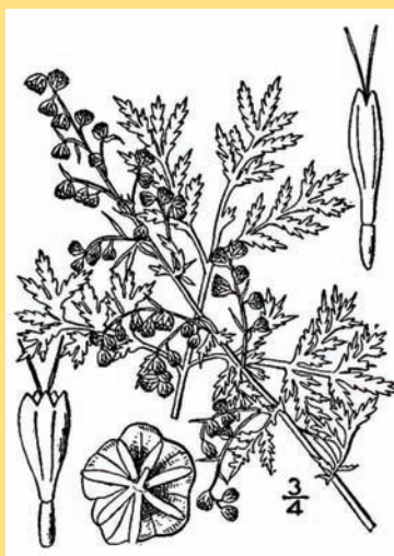
Artemisia annua