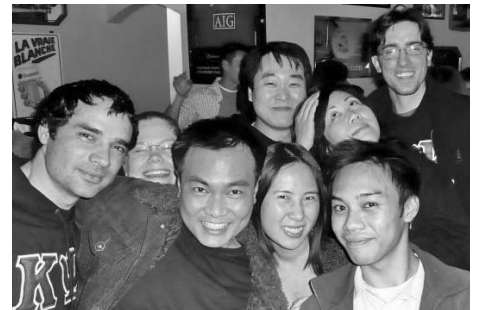
First-year pharmacy student members of Beta Omicron socialize at the Province X assembly.