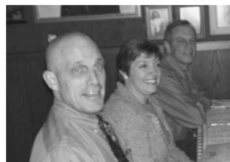
Class of 1972 alumni celebrate at Buca Di Beppo