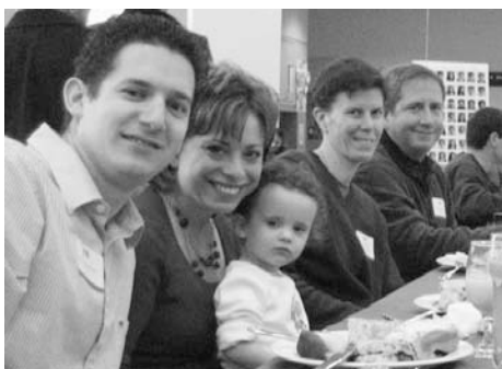
Above: Class of 2002 introduce new members of the family Below: Class of 1957 celebrate their 50th reunion